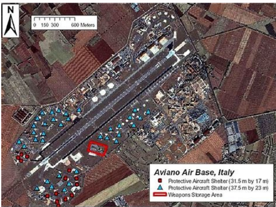
Aviano Air Base, Italy (October 15, 2003). This base is located in northeastern Italy (46°01'N, 12°35'E) near the Slovenian border. There are 49 Protective Aircraft Shelters on the base, 35 of which are large (37.5x23 meters) and the rest small (31.5x17 meters). Eighteen of the shelters are equipped with WS3 Vaults for nuclear weapons storage with a maximum capacity of 72. The vaults were completed in 1990. Prior to that, nuclear weapons were stored in the underground Weapons Storage Area. The base stores 90 B61 nuclear bombs for delivery by U.S. F-16C/D aircraft of the 31 st Fighter Wing's 510 th and 555 th fighter squadrons.